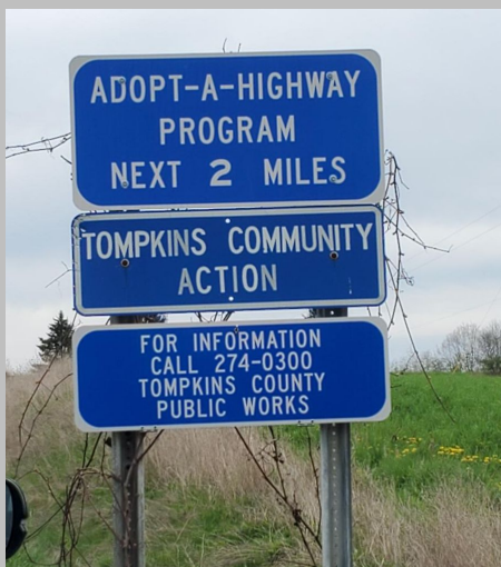
Adopt- A- Highway