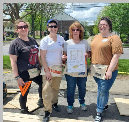
Habitat for Humanity Women Build Weekend